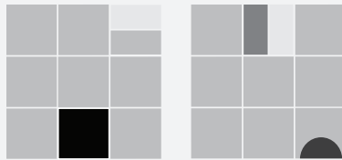
Mid Mod Squares | Sheet 1